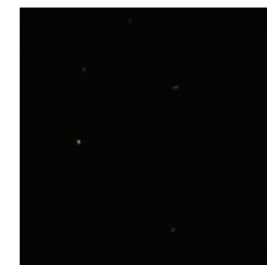
With Microban® protection

Microban protection is registered with the EPA for all applications and Microban additives can be found in leading consumer and industrial products around the world. In addition to Luxury Bath®, Microban also proudly partners with Conair®, Rubbermaid®, Bissell®, Reebok®, Whirlpool®, Kimberly Clark®, and Sherwin-Williams®. Microban is infused into SimplyPure™ and Luxsan® surfaces, providing you with continual assurance that all Luxury Bath products will remain clean and fresh for longer. Luxury Bath's SimplyPure system will remain free of mold and mildew.