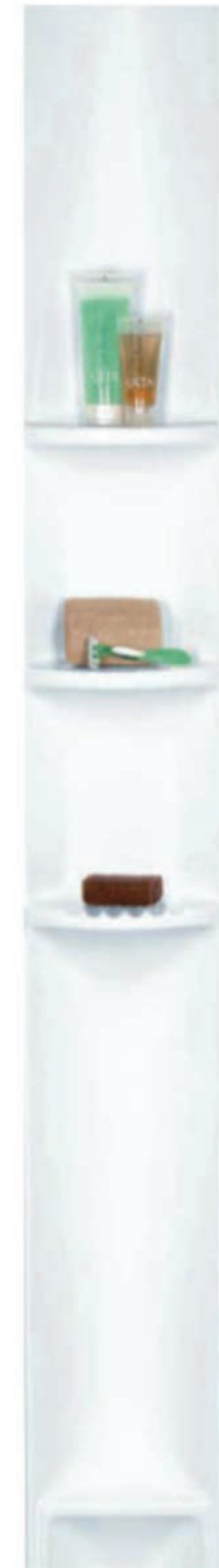
Tower Caddy with Foot Rest