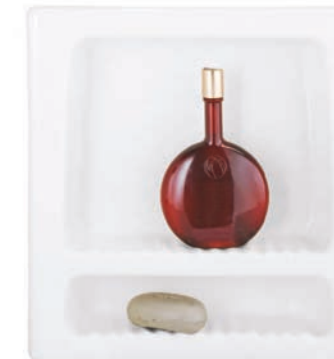
Tall & Wide Soap Dish