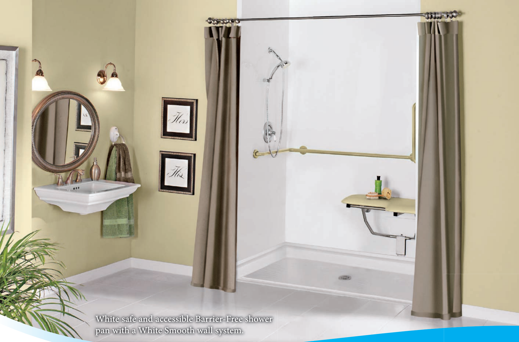
White safe and accessible Barrier-Free shower pan with a White Smooth wall system.