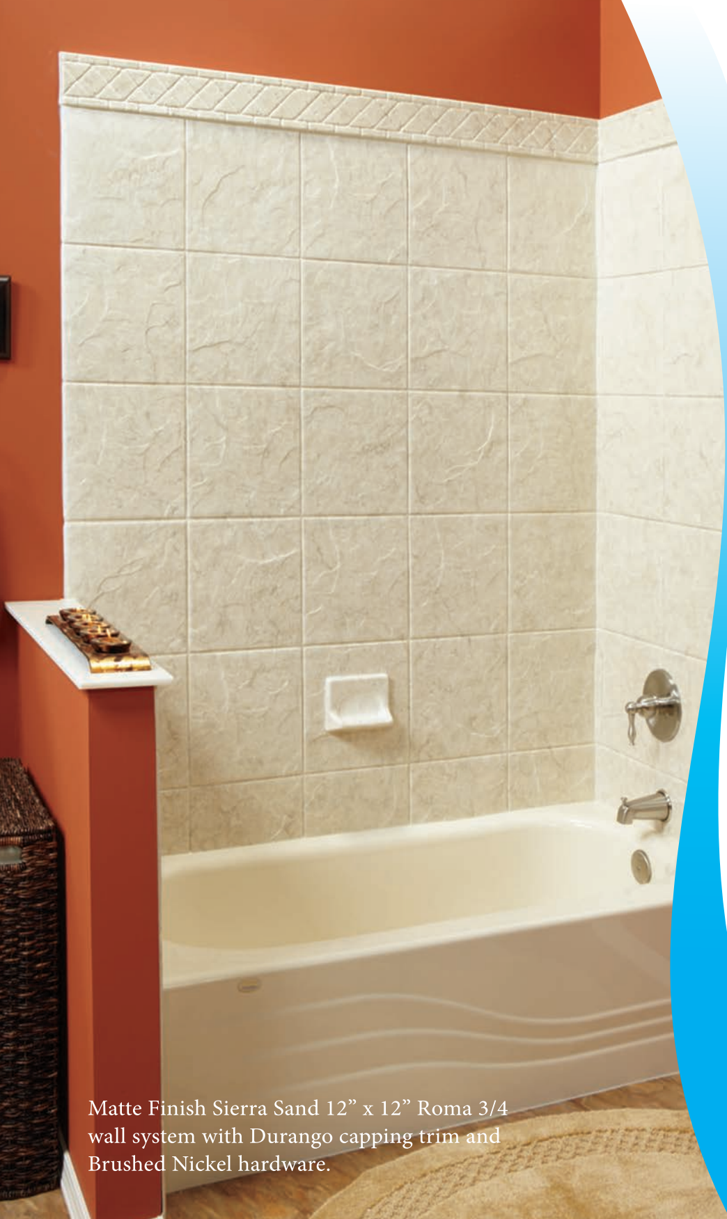
Matte Finish Sierra Sand 12" x 12" Roma 3/4 wall system with Durango capping trim and Brushed Nickel hardware.