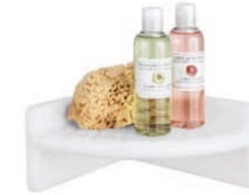
1 Corner Shelf