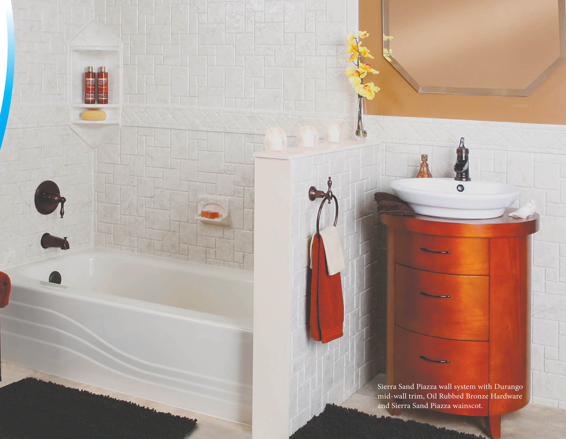
Sierra Sand Piazza wall system with Durango mid-wall trim, Oil Rubbed Bronze Hardware and Sierra Sand Piazza wainscot.