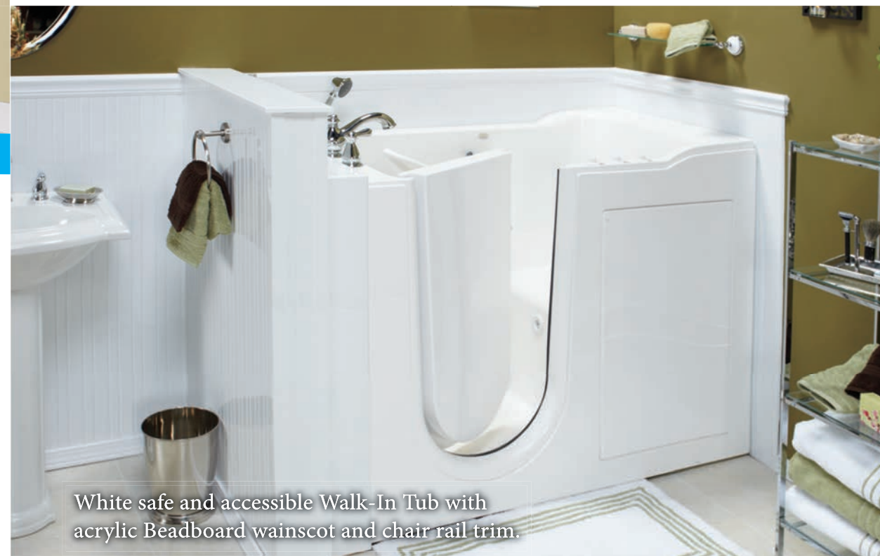
White safe and accessible Walk-In Tub with acrylic Beadboard wainscot and chair rail trim.

Luxury Bath's product lines are aesthetically pleasing and functionally accessible. We are committed to our customers' continual freedom and independence. Let us replace your current, high-sided tub with an accessible walk-in tub. As with all Luxury Bath products, these accessible tubs are made of the finest materials available. Additionally, add optional accessories, like grab bars or whirlpool jets. Luxury Bath also specializes in barrier-free showers for people with limited mobility. When it comes to showers, accessibility and luxury have a lot in common. Some of the hottest design trends — large, walk-in showers with no doors and versatile body sprays — fit right in with designs that make showers safe, accessible and enjoyable to use. Luxury Bath's unique designs make bathrooms work for everyone, regardless of age, size and ability, ensuring that your bath system will serve you well for years to come.