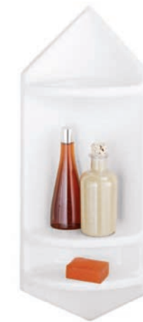
3 Shelf Caddy