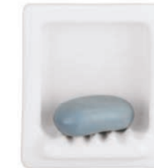
Recessed Soap Dish