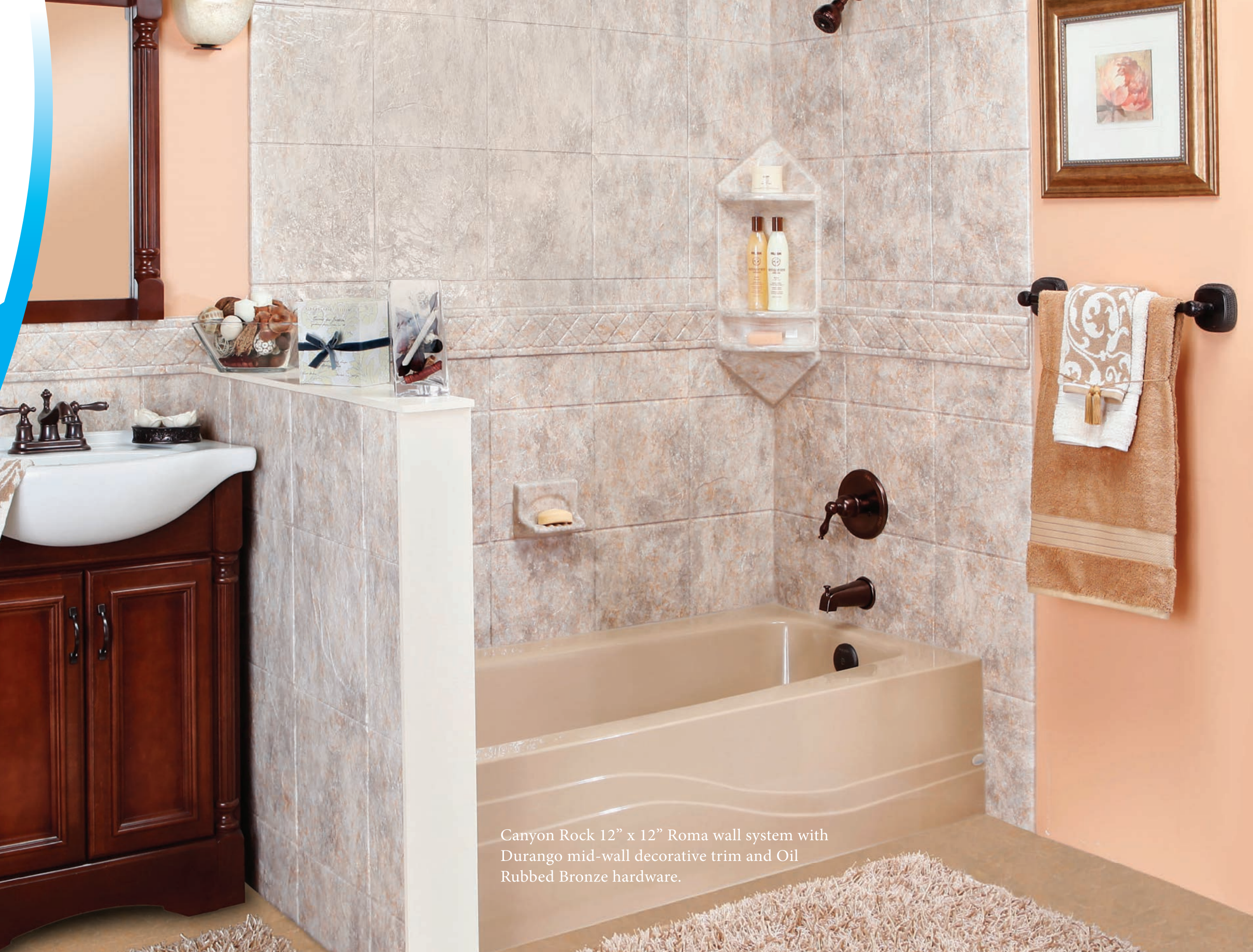
Canyon Rock 12" x 12" Roma wall system with Durango mid-wall decorative trim and Oil Rubbed Bronze hardware.