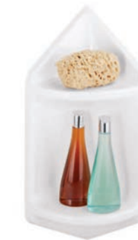
2 Shelf Caddy