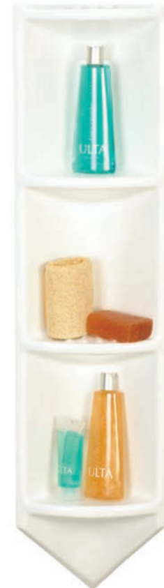
4 Shelf Caddy