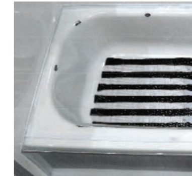
Black Butyl Tape