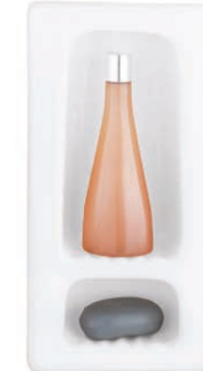
Tall Double Soap Dish